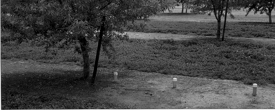
Neutron probe access tubes in the herbicide-treated strips down the tree row measure soil water content in a Salina strawberry clover planting.